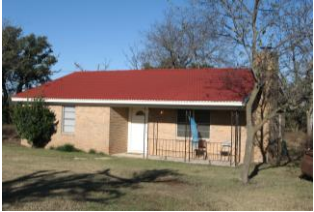
Gault fieldhouse 3433 FM 2843